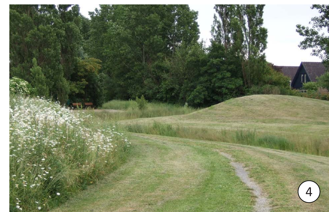
Shallow Depression (Swale) - with sloping grass banks